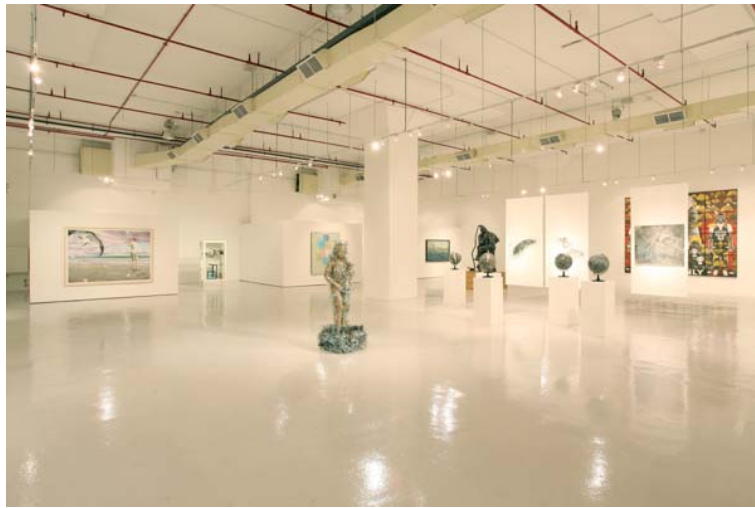
Installation shot from the exhibition at ARNDT Singapore.

difficult early stages through many confrontations in the market [...] I'm also a bit proud to have played a role in the 'Berlin Miracle' and to have made it possible for many artists to enter the market." He added, "Never in my wildest dreams could I have imagined that I would one day achieve so much success or have such a global presence."