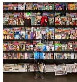
Spotlight on Art Stage Singapore 2014